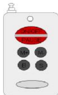
Body Panel Remote control

Controlled both by remote controller and pressing buttons on the body panel, function of each as below: